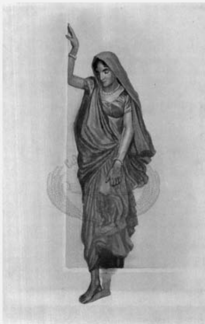
A GLIMPSE AT A DOOR IN GUJARÁT